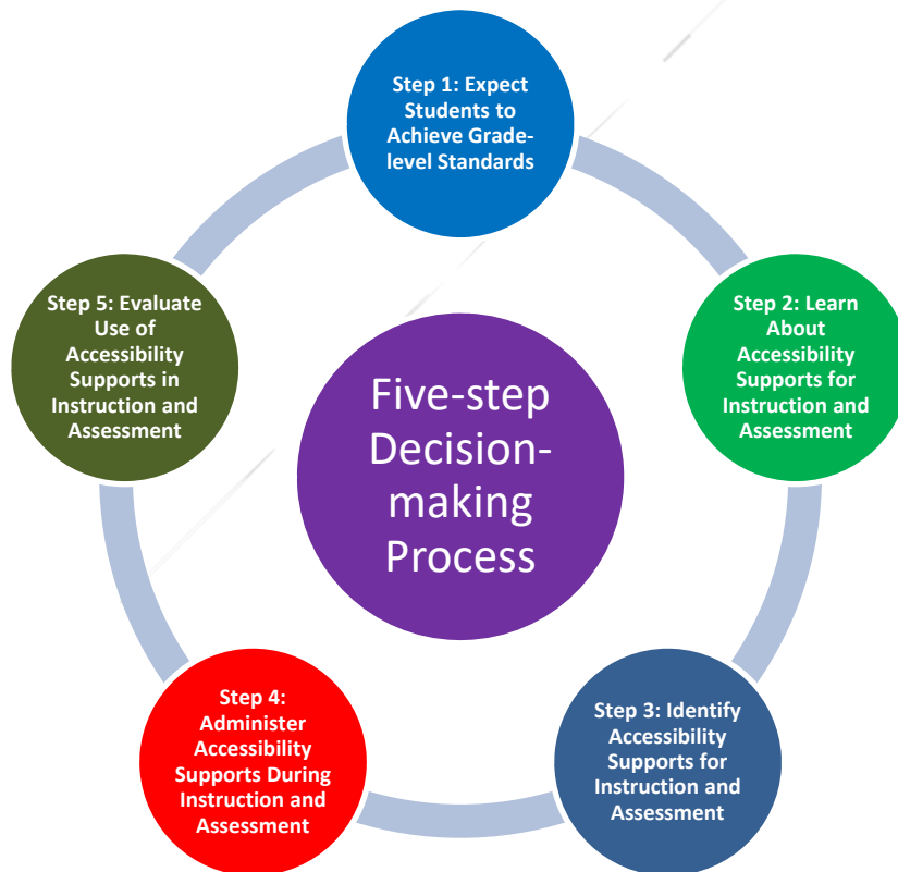
Figure 1. Five-step Decision-making Process for Administering Accessibility Supports

The manual outlines a five-step decision-making process for administering accessibility supports. Figure 1 highlights the five steps discussed in the manual.