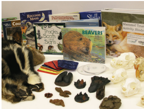
Mammals of Nebraska

Nebraska Project WILD's Wildlife Education Trunks are an amazing way to expand or supplement your curriculum while providing a fun, hands-on experience for your students.