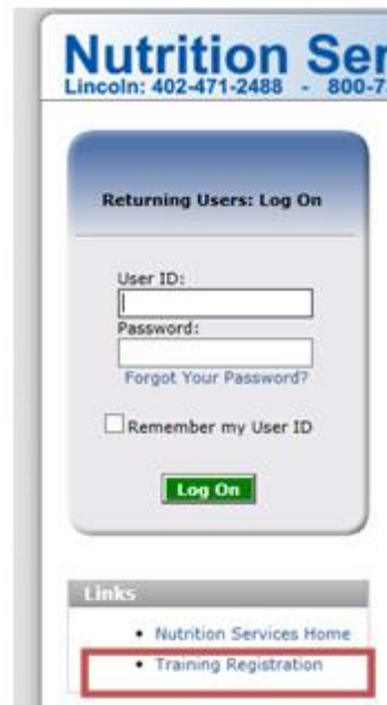
Figure 1. CNP log in and Training Registration