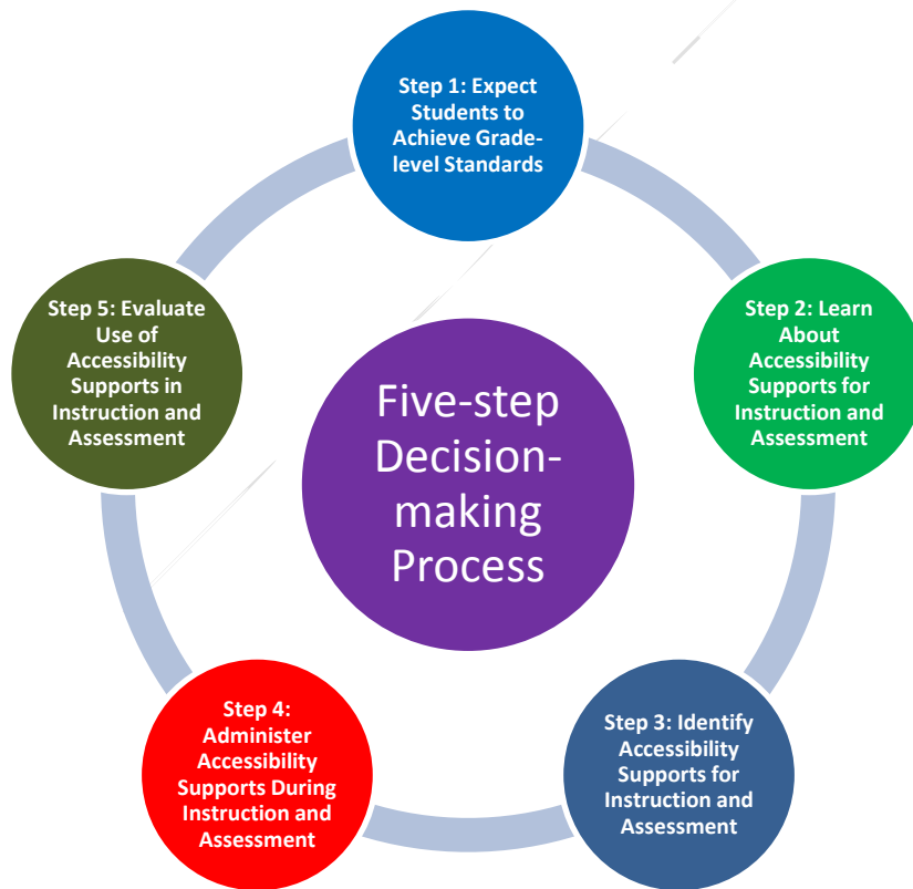
Figure 1. Five-step Decision-making Process for Administering Accessibility Supports

The manual outlines a five-step decision-making process for administering accessibility supports. Figure 1 highlights the five steps discussed in the manual.